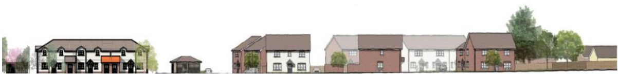
View of the development from the recreation ground to the north

The terrace at the east end of the site would be of slightly reduced height with a 1½ storey form as seen in here on the left when viewed from the north: