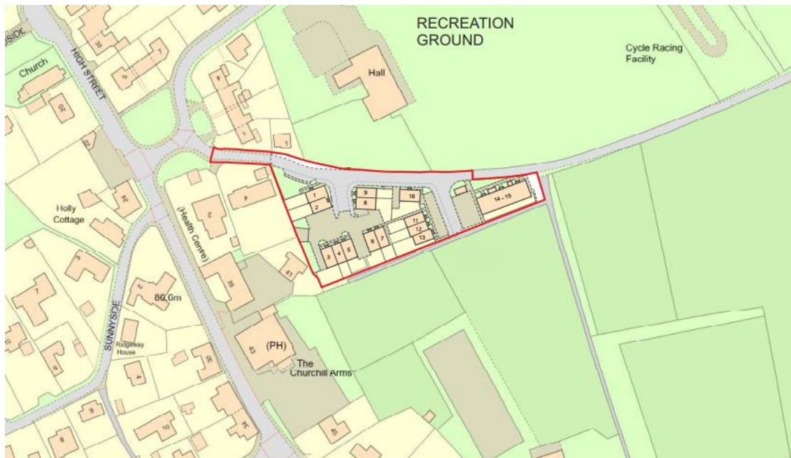
Proposed Site Plan

The development would be 2-storey, comprising detached, semi-detached and terraced properties.