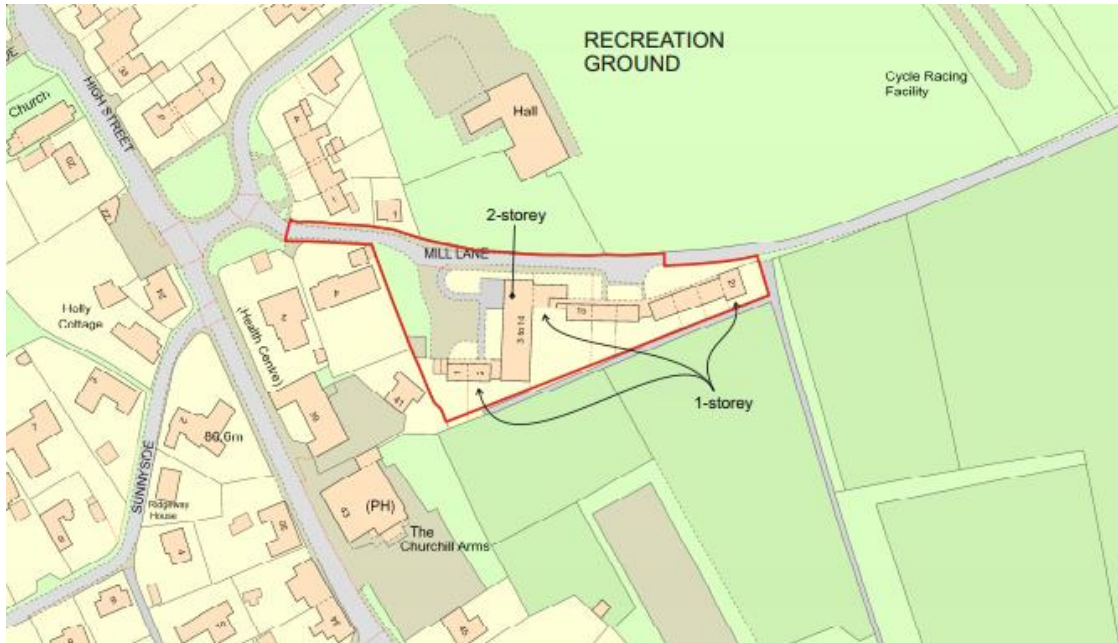
Existing Site Plan

The development would be 2-storey, comprising detached, semi-detached and terraced properties.