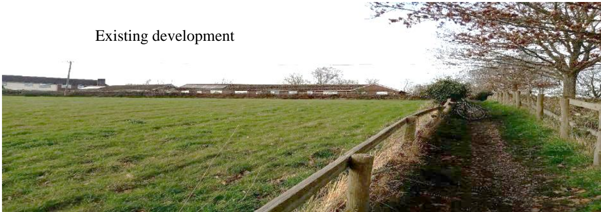
Approach to the site from the south along Footpath 19

The view above is relatively localised however and when viewed from the surrounding countryside, the development would be viewed more generally in the wider context of the backdrop of the village, in which, whilst it would be more prominent than the existing development, and as concluded in the submitted Landscape Impact Assessment, it would not result in any material impact upon the rural or landscape character of the area, or the setting of the village or its nearby conservation area.