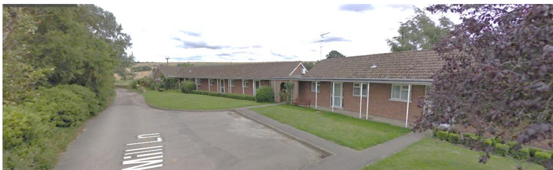
Terraces of bungalows at the east end of the Hedges House site