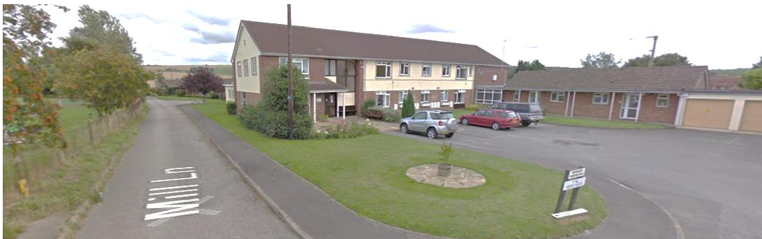
View of Hedges House facing east along Mill Lane

Hedges House comprises a combination of single and 2-storey dwellings, with the bungalows being set towards the outer edges of the site: